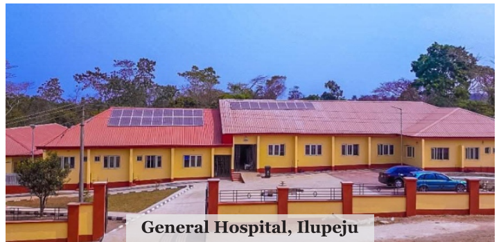
General Hospital, Ilupeju