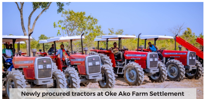
Newly procured tractors at Oke Ako Farm Settlement