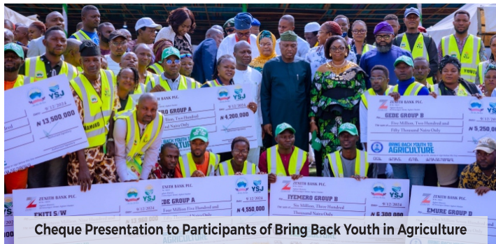
Cheque Presentation to Participants of Bring Back Youth in Agriculture