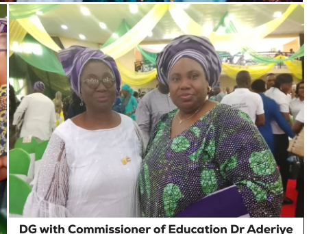
DG with Commissioner of Education Dr Aderiye