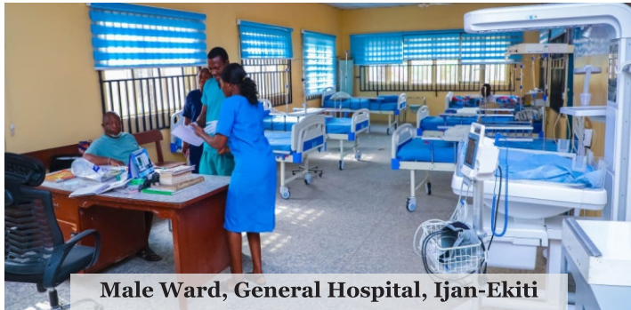
Male Ward, General Hospital, Ijan-Ekiti