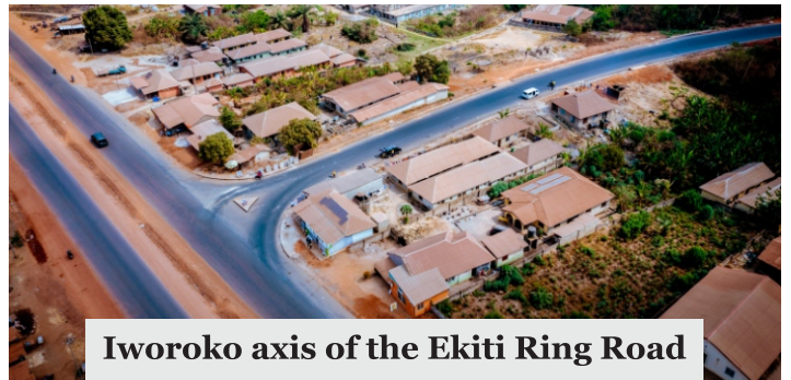
Iworoko axis of the Ekiti Ring Road