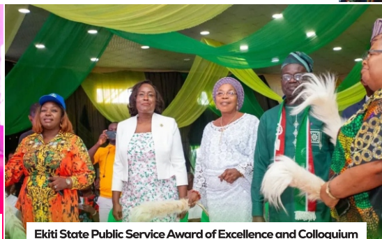
Ekiti State Public Service Award of Excellence and Colloquium