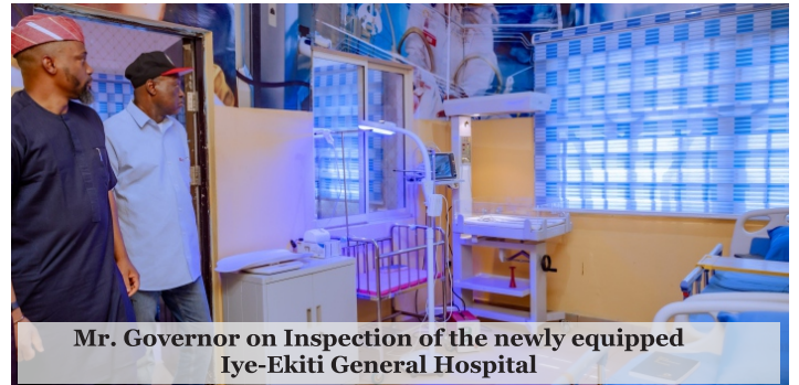
Mr. Governor on Inspection of the newly equipped Iye-Ekiti General Hospital