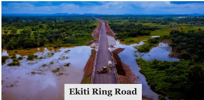
Ekiti Ring Road