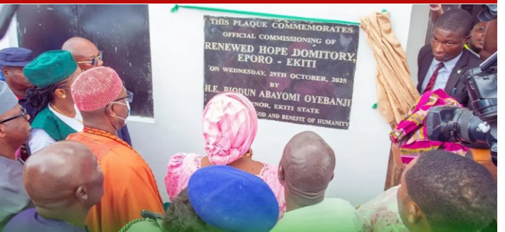
PROJECT COMMISSIONING BY THE SPEAKER, RT HON. ADEOYE STEPHEN ARIBASOYE